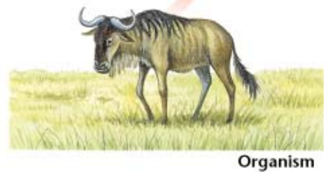
Figure 4 ► An individual organism is part of a population, a community, an ecosystem, and the biosphere.

Organisms An organism is an individual living thing. You are an organism, as is an ant crawling across the floor, an ivy plant on the windowsill, and a bacterium in your intestines.