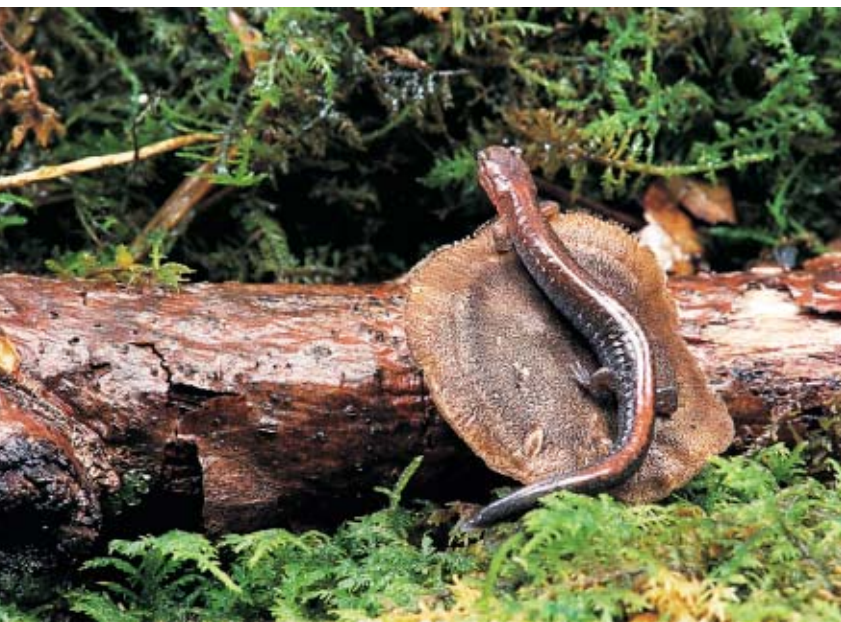
Figure 6 ▶ Salamanders, such as this red backed salamander, live in habitats that are moist and shaded.

The most obvious difference between communities is the types of species they have. Land communities are often dominated by a few species of plants. In turn, these plants determine what other organisms live in that community. For example, the most obvious feature of a Colorado forest might be its ponderosa pine trees. This pine community will have animals, such as squirrels, that live in and feed on these trees.